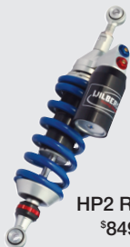
HP2 Rally $849

Call us for pricing and set-up information for any BMW.